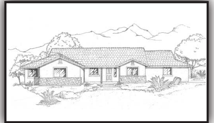
Optional Plan 2973B

Plans and information contained in this brochure are subject to change without notice. R.L. Workman Homes, Inc. offers similar but not identical homes in other communities. Differences may exist between communities as to square footage, standard and optional features. Square footage is approximate. Plans and elevations are artist's conception. This plan is property of R.L. Workman Homes, Inc.